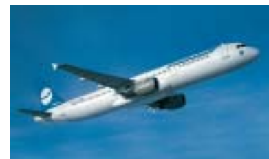
Above the clouds extremely heavy demands are made on fabrics.