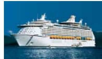
Textiles for passenger vessels must be completely suitable for the high seas.

Because safety also has to look good, well-known manufacturers and suppliers from all over the world offer more than 1,000 different collections in Trevira CS fabrics. This choice makes it possible to design safety into textile elements in all types of transport – from seating to decorative interiors and all, of course, in the corporate design colours of the company.