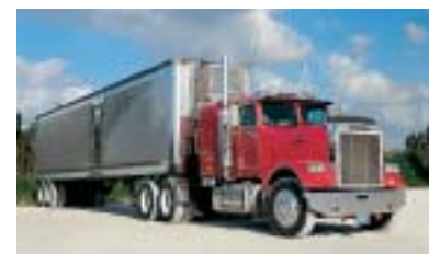
Even more safety in road transport thanks to interior textiles that are flame retardant.