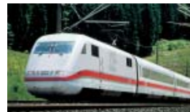
Bringing all the advantages of safety fabrics on track.