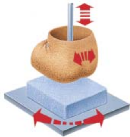
This test simulates typical wear and tear on seating. Here Trevira CS shows high resistance to abrasion and wear.